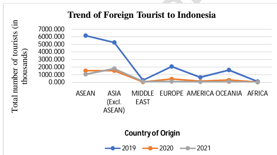
Figure 1. Graphic of foreign tourist in Indonesia

Figure 1 depicts the trend of foreign tourists to Indonesia as a decreasing linear line from 2019 to 2021. It can also be seen that the majority of foreign tourists visiting Indonesia come from ASEAN, Asia, and Europe countries, as they outnumber other countries. Meanwhile, African tourists are the fewest.